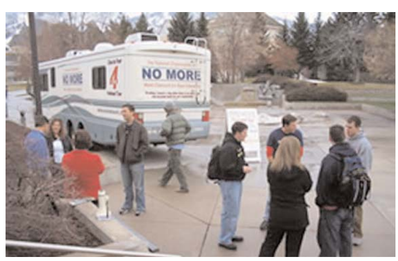
2005-06 National Peer Educator Tour

wenty colleges and universities make up the 2005 cohort of grantees from the U.S. Department of Education's competition for Grants to Prevent High-Risk Drinking or Violent Behavior Among College Students. Grantees receive funds to develop or enhance, implement, and evaluate campusand/or community-based prevention and early intervention strategies to prevent high-risk drinking, drug abuse, or violent behavior among college students.