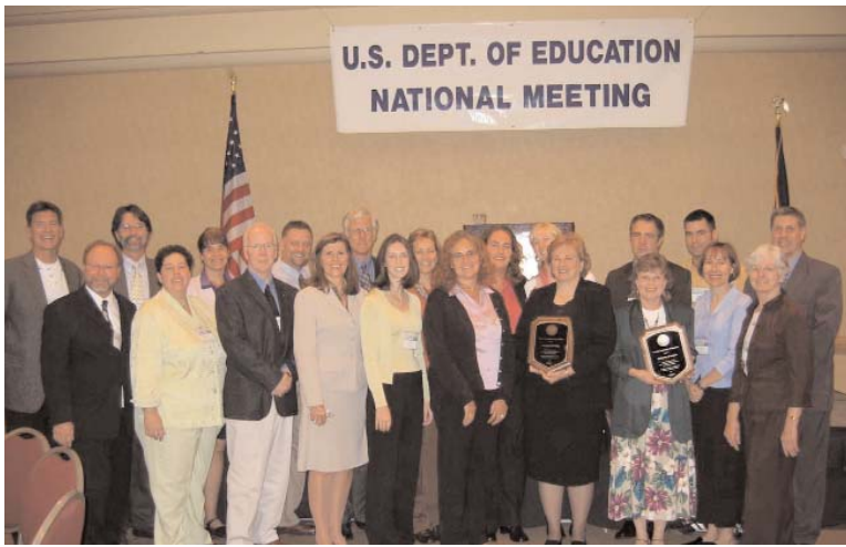
The U.S. Department of Education's Alcohol and Other Drug Prevention Models on College Campuses 2005 grant competition awardees

ore than 500 prevention practitioners, higher education professionals, researchers, and local, state, and federal government officials came together for the U.S. Department of Education's 19th Annual National Meeting on Alcohol and Other Drug Abuse and Violence Prevention in Higher Education (National Meeting) in Indianapolis in